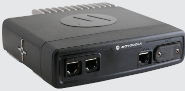
ETHERNET EXPANSION HEAD 2X STD, ETHERNET TYPE, ETHERNET SIM READER AND RS232