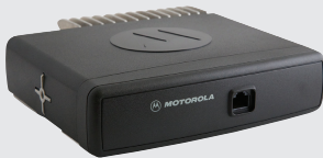
EXPANSION HEAD SINGLE STD CONNECTION