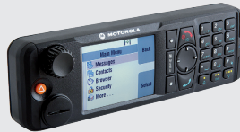
REMOTE CONTROL HEAD