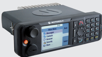
DASH MOUNT CAR, TRUCK