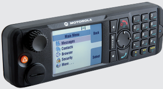
REMOTE ETHERNET CONTROL HEAD (ReCH) SUPPORTS EXTERNAL SPEAKERS AND PTT