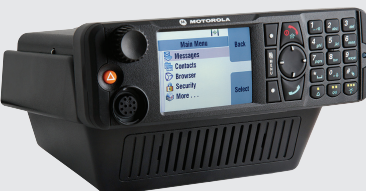
DESK MOUNT CONTROL CENTRE