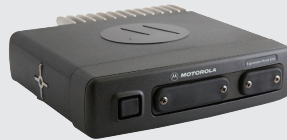
EXPANSION HEAD ENHANCED STD AND AUXILIARY 25 PIN AND RS232