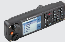
IP67 CONTROL HEAD