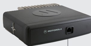
REMOTE HEAD MOUNT CAR, AMBULANCE, FIRE TRUCK