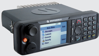
STANDARD CONTROL HEAD